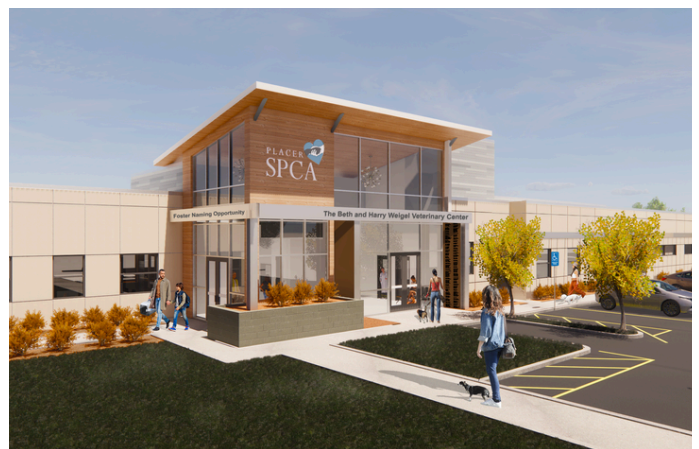
This is a rendering of our new Veterinary and Foster Care Center.

Scan this QR Code or use our secure online giving page at: https://placerspca.org/pawsibilitiesdonation/