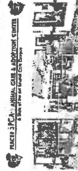
PLACER SPCA ANIMAL CARE & ADOPTION CENTER A part of our Animal Care Program

Revenue raised from the Thrift Store benefits the animals at the Placer SPCA